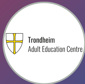
Voksenopplæringsenter vgs – Norway