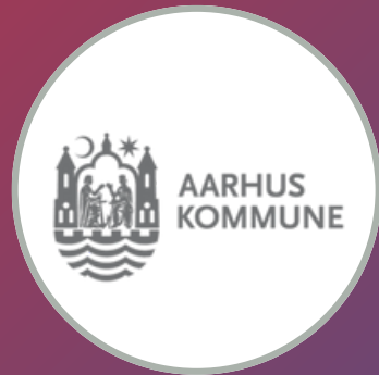
AARHUS KOMMUNE – Denmark